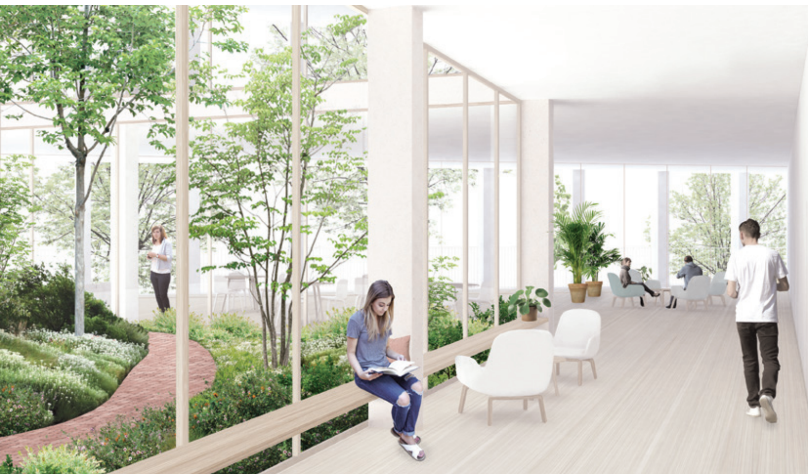
Nature can be utilized in a therapeutic setting even in an urban environment.

care has gone down over the last ten years, although the total number of psychiatric patients has gone up over the same period. The hospital's role is thus seen to support and rehabilitate the patient towards increasing independence.